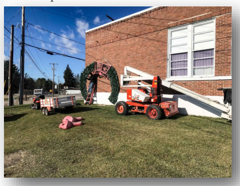
Chuck Dinsmore is standing on a ladder assembling the parts of the wreath.