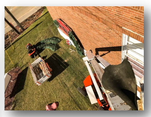
The above view is looking down from a telescopic boom lift.

Dave Haskin and Chuck Dinsmore assembled the large wreath that is hung on the south side of the main museum building each year.